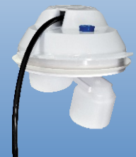
Point of Use Kit