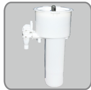
Removable Reservoir/Faucet Assembly (patent pending)