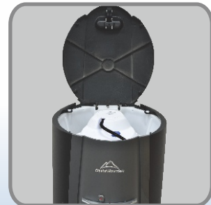
Retrofitted to Become a Point of Use Dispenser