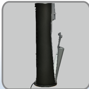
Replaceable Lower Front Panel with Optional Integrated Cup Dispenser